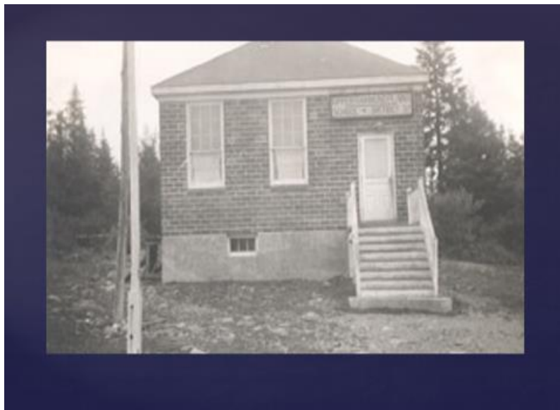
The Upper Hammonds Plains School from 1940's

A major change to the community came in 1957, when the Hammonds Plains road was widened and paved. This opened up the road to greater traffic and new sub-divisions soon started to become the face of the community, the first being Uplands Park in 1962. Fire Departments were created in both Upper and Lower Hammonds Plains. In 1967, the Hammonds Plains Consolidated School was opened, taking in all the students of the Hammonds Plains area, thus closing the outdated Hammonds Plains and Upper Hammonds Plains Schools.