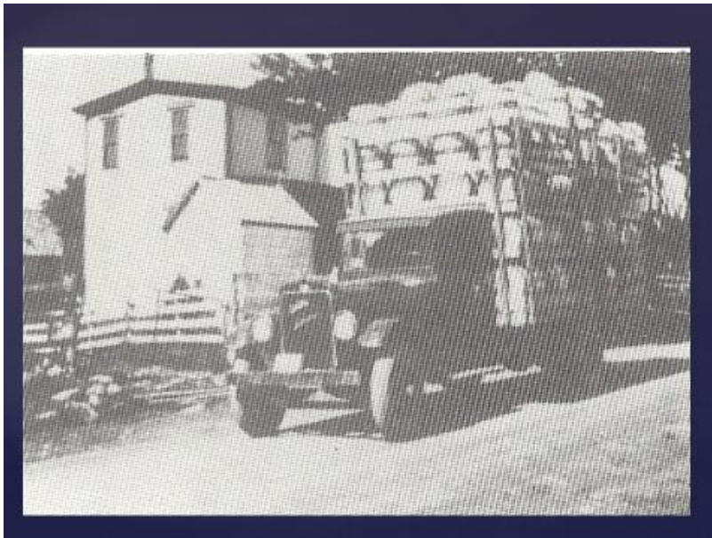
Load of Barrels on the way to Halifax – 1930's

Hammonds Plains was a thriving independent community by the beginning of the 20 th century. The community saw on a daily basis, wagons of barrels and boxes heading to market in Halifax. Phones came to the community in 1902, with the community creating its own phone company, the Hammonds Plains Phone Company, originally consisting of three phones. A new community hall was built in 1912 in Lower Hammonds Plains. Cars were introduced to the community just before the First World War, with the first residents owning cars by the early 1920's. Power lines were put through the community in 1932, bringing electricity to the area. The era of oil lamps for light had come to an end. The first half of the century saw the wooden box business become an economic driver within the community, which complemented the traditional barrel making business. The community was tightly knit during this time with many community events, such as suppers, box socials, the Labour Day picnic and turkey shoots attended by many.