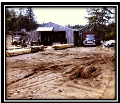
Haverstock Mill on Pockwock Lake 1960's