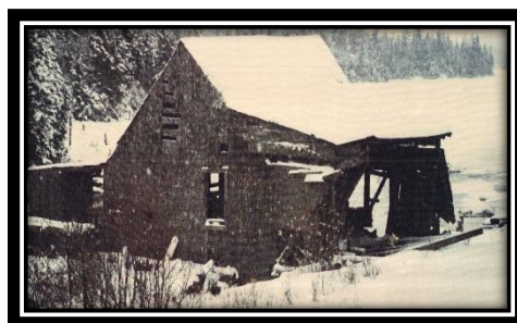
Remains of Wright's Mill on Wright's Lake 1960's