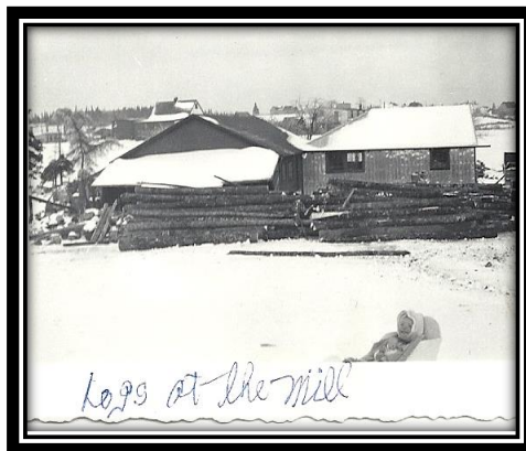
Eisenhower's Mill (Hatfield Farm's) - 1950's