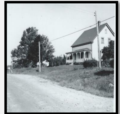
Along Hammonds Plains Road – 1950's

November 26 th (Hammonds Plains Community Center) – A Decade of Change – Hammonds Plains During the 1950's