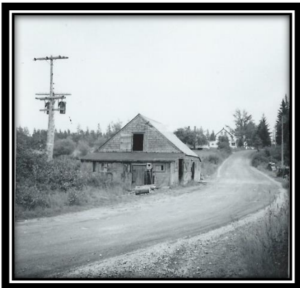
The Mill on Mason's Pond (1955)