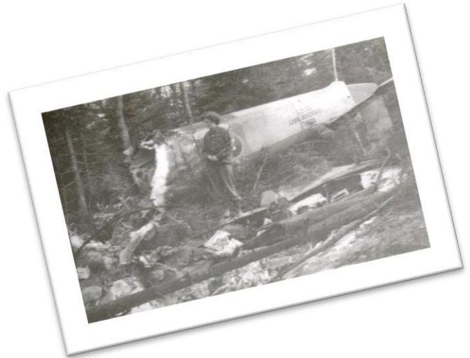
The Airplane Crash of 1951