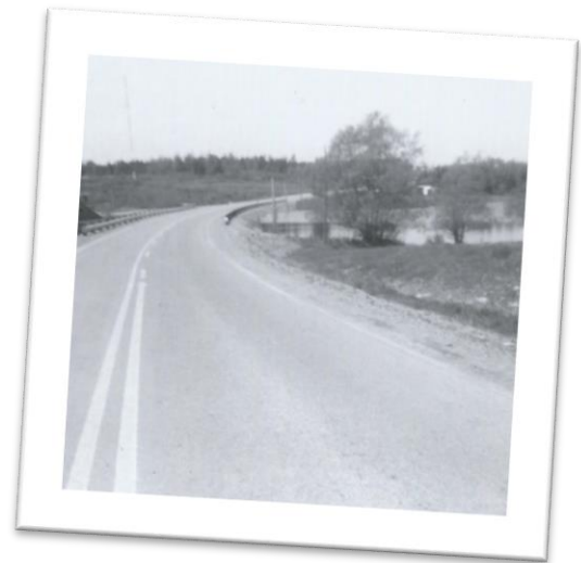
Hammonds Plains Road after Paving - 1959