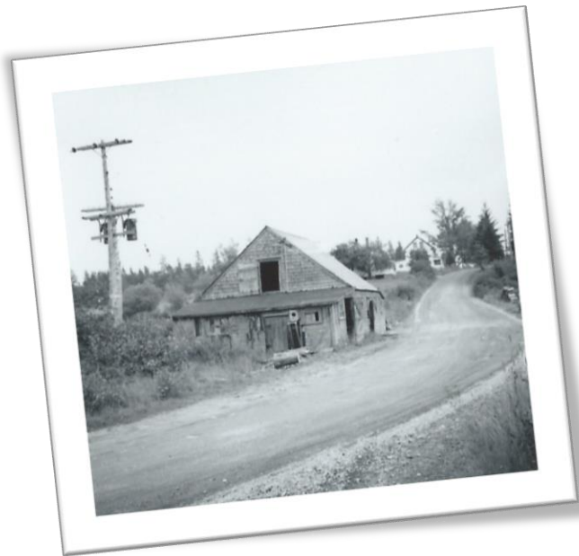
Hammonds Plains Road before Paving-1955