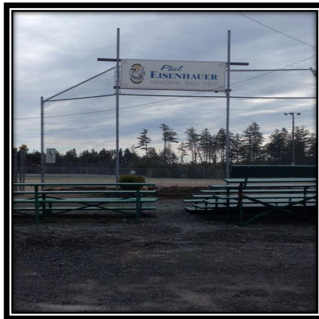
Phil Eisenhauer Memorial Ball Field – Located behind Hammonds Plains Community Center