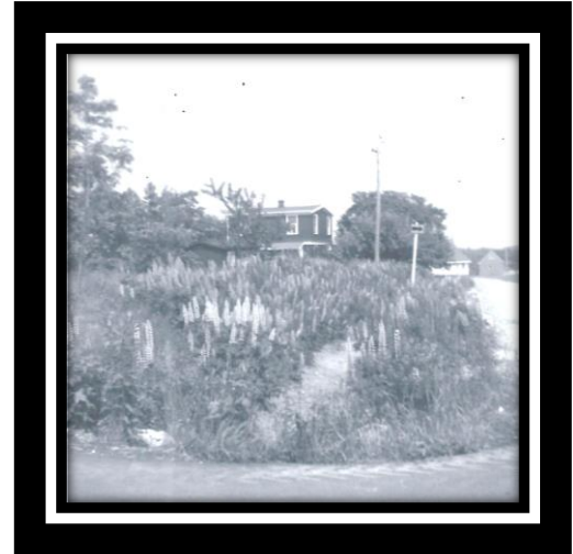
English Corner 1969 – Did you know that the corner was once a haven for Lupine Flowers?

For our upcoming presentation on 'Life in Hammonds Plains During the 1960's', we are looking for pictures that we can use in the presentation. Let us know if you know where we can get some.