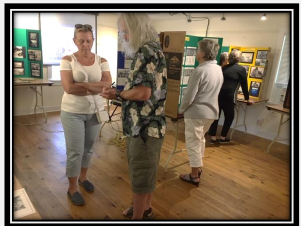
A Photo from August 27 th when the Hammonds Plains Historical Society organized a display on Hammonds Plains History at Bedford's Scott Manor House.