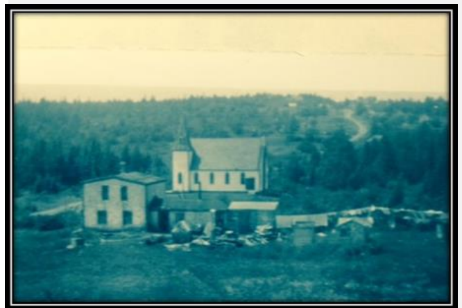
Upper Hammonds Plains from the 1940's

To-day Upper Hammonds Plains stands as a historical symbol for the contribution of the African culture in our province, overcoming a past where their ancestors didn't have a name to call home by.