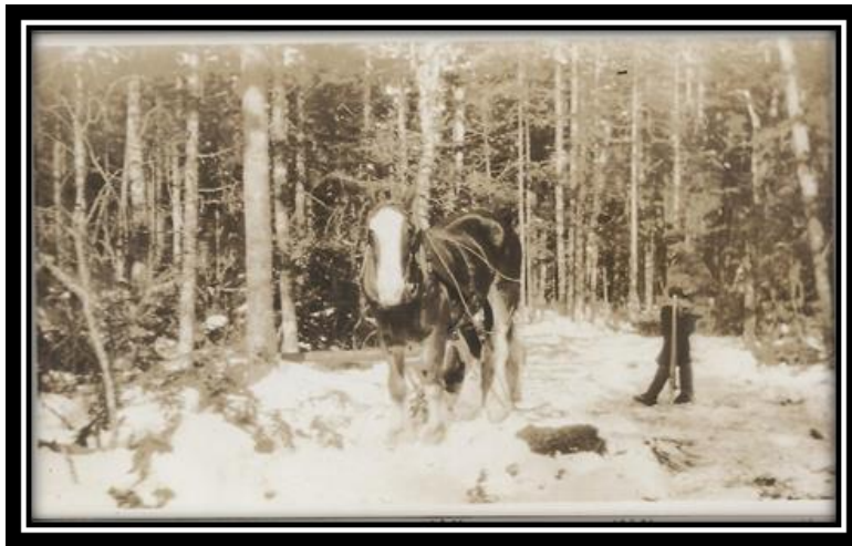
Hammonds Plains horse teams heading to the woods to begin logging operations – 1930's. (Unlike recent years, there used to be snow on the ground in November).