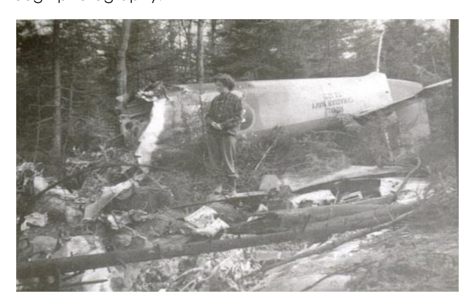
Plane Crash at Wright's Lake, Kemptown - 1951

At our General meeting on May 26th, we are planning a <u>picture</u> <u>night</u>. We are hoping our membership will bring a picture(s) of Hammonds Plains from the past. The picture could be a picture of a building, a community event, fashions of a by-gone era or past industry within the community. At the meeting each person with a picture will be asked to talk about their picture to the group for a few moments. Come and learn about our history, through photography.