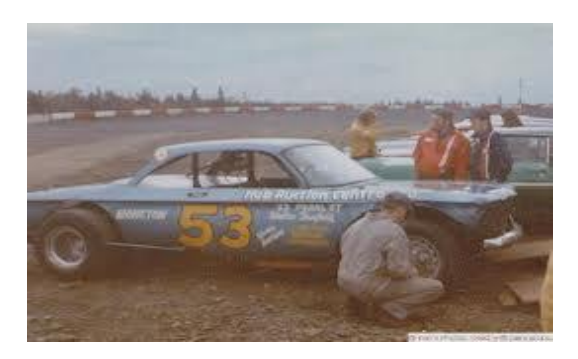
A view of cars getting ready to race on Atlantic Speedway