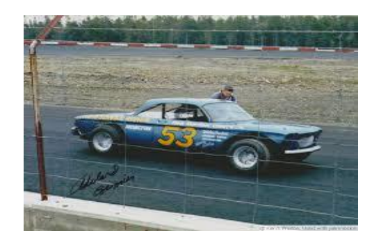
A Race Car on Atlantic Speedway - Mid 1970's

Atlantic Speedway (currently where Atlantic Playland is located to-day) was opened in 1970, with a racing oval, grandstand, control tower and parking lot carved out of the woods, on to the Lucasville Road. The track consisted of a half mile paved track with banked turns.