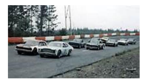
Racing at Atlantic Speedway – 1977

Recent inhabitants to the community may find it hard to believe, but those living here during the 1970's will remember the roar of race cars filling the quiet summer Sunday evenings. The Hammonds Plains area was indeed a Stock Car hotbed during the 1970's.