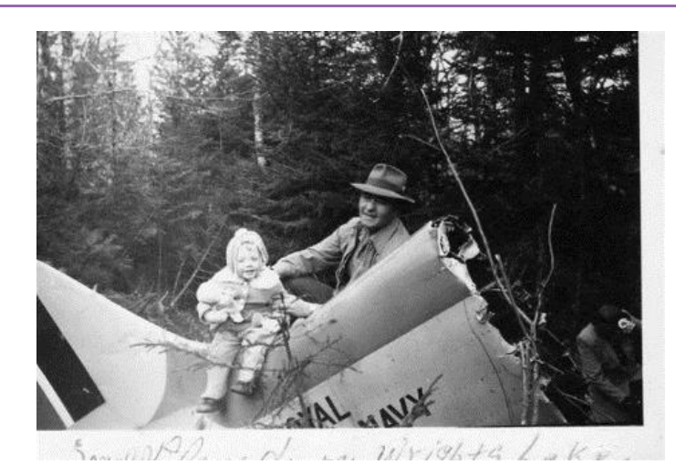
A local resident sitting on tail of crashed plane - 1951

One of the most unique newsworthy events of the 20<sup>th</sup> century in Hammonds Plains, was the 1951 plane crash . The following reviews the details of the plane crash and its aftermath.