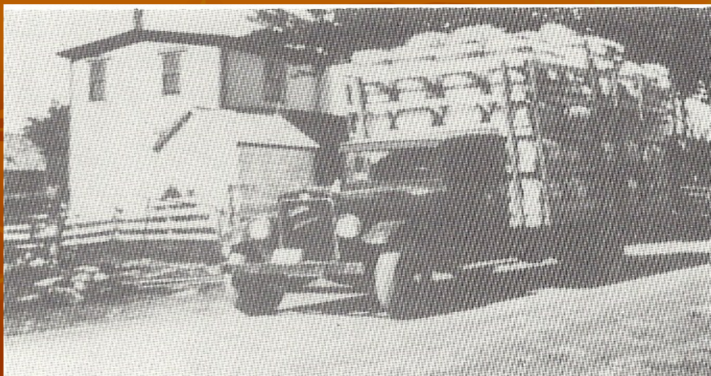
During the 1930-40's, truck or wagon loads of barrels were often seen on the Hammonds Plains Road travelling to Halifax from the local copper shops. This truck is shown across from the Baptist Cemetery.