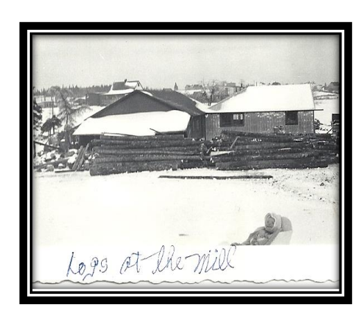
Eisenhauer's Mill (Haffield Farm's) – 1950's