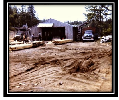
Haverstock Mill on Pockwock Lake