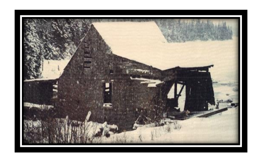
Remains of Wright's Mill on Wright's Lake