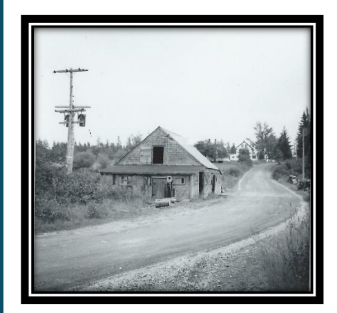
The Mill on Mason's Pond (1955)