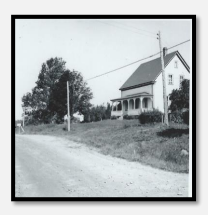
Along Hammonds Plains Road -1950's

November 26<sup>th</sup> (Hammonds Plains Community Center) - A Decade of Change - Hammonds Plains During the 1950's