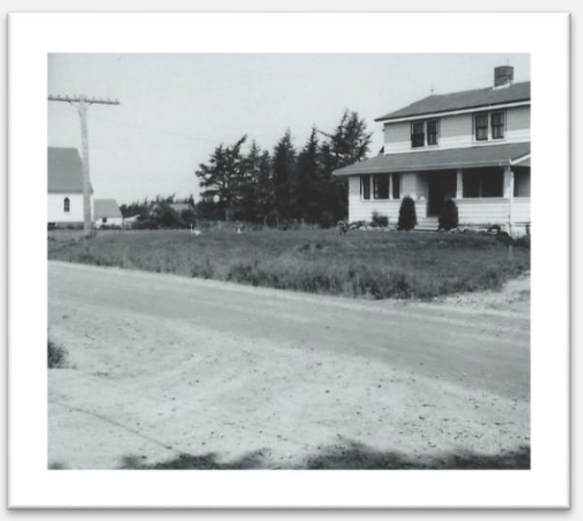
Page 2 of 4