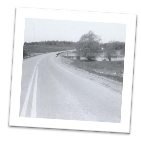
Hammonds Plains Road after Paving - 1959