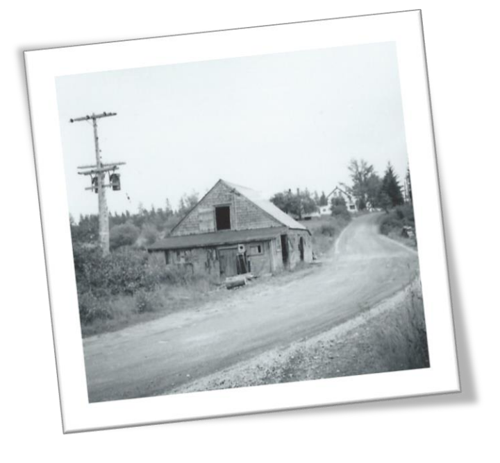
Hammonds Plains Road before Paving-1955