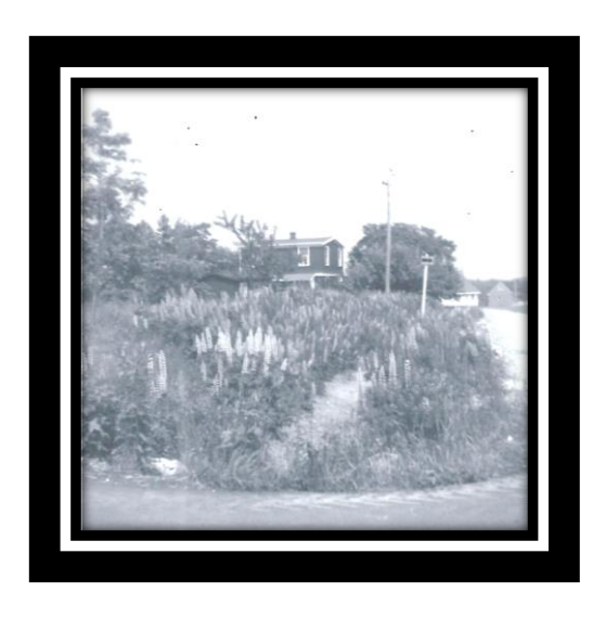
English Corner 1969 – Did you know that the corner was once a haven for Lupine Flowers?

For our upcoming presentation on 'Life in Hammonds Plains During the 1960's', we are looking for pictures that we can used in the presentation. Let us know if you know where we can get some.