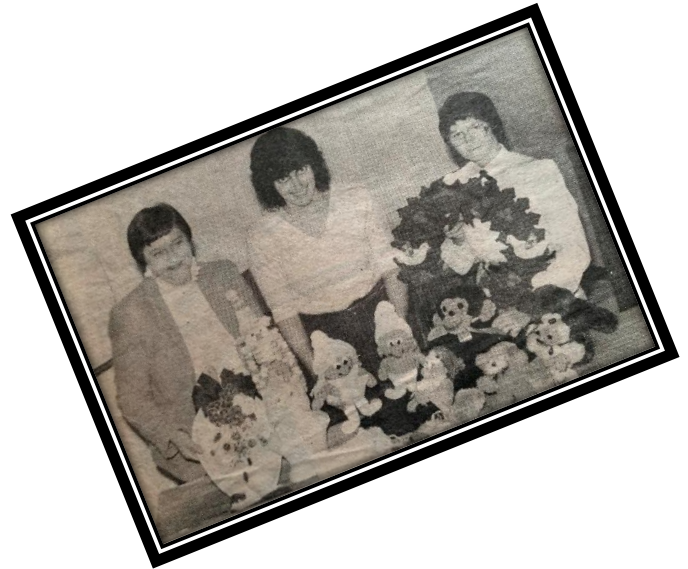
Showing the Smurf Characters for sale at the 1988 Bazaar