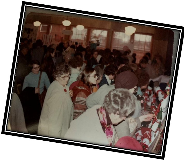
Crowd shown during the first Bazaar – 1976