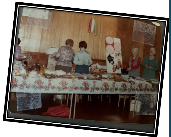
Setting up for Bazaar - 1976

Quote from Halifax Mail Star article – Nov. 10 th 1988