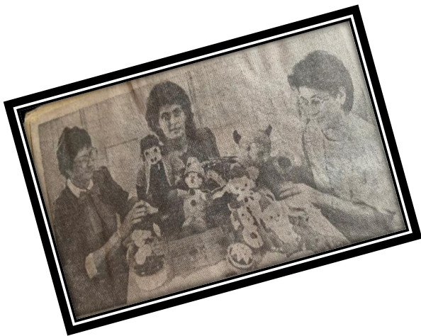
Preparing for Bazaar – 1986

"... the day is an opportunity for fellowship. We see these folks in the community and sometimes go to each other's events, but the ABC Bazaar is the one time we work together"