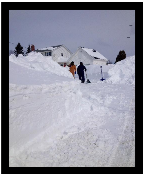
This photo was taken in Hammonds Plains March 19, 2015

This year, early March was a period of cold and snow. But when you compare it to 2015, one would take this year anytime.