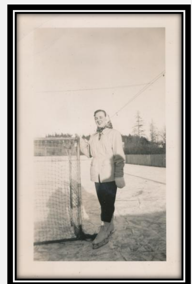
Shown is a photo from one of the Hammonds Plains rinks – Early 1950's

During most of the 1900's Hammonds Plains had an operational community outdoor rink, opened to skating and games of hockey. At our May AGM we will take a look at these rinks, outlining their history and influence on the community.